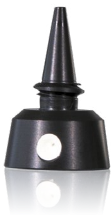
White/Red dot applicator