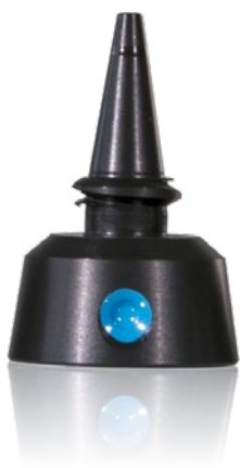
Blue/Red dot applicator

CryoPen® is supplied with a range of applicators allowing for change of tip sizes dependant on the shape and size of the lesion being treated.