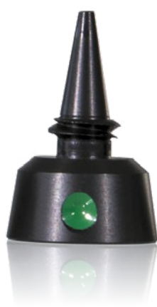
Green/Red dot applicator